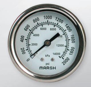
NOTE: Items are available on special order. However, minimums and lead times apply. Consult factory.

Typical applications include refineries, chemical plants, offshore platforms, oil rigs, marine applications and OEM processes.